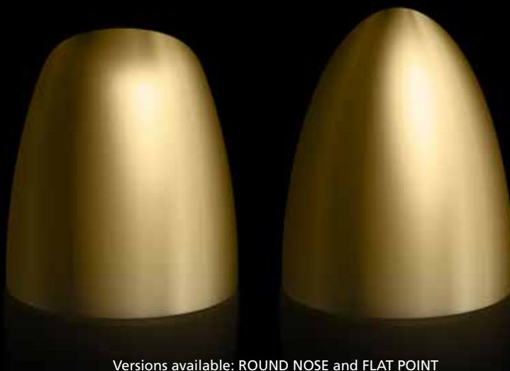
Versions available: ROUND NOSE and FLAT POINT